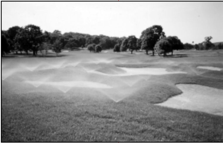
Specialized irrigation systems increase the precision of water application.

Localized Dry Spots (LDS) occur when the sand grains become coated with organic acids that are thought to be a by-product of organic matter decomposition.