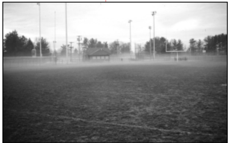
A humid air mass reduces evapotranspiration as a result of high water content in the air.

For example, as the soil dries, roots send chemical signals upwards to the region where growth occurs. These chemical signals are hormones, specifically abscisic acid, which triggers a reduction in leaf growth so that the plant can conserve water.