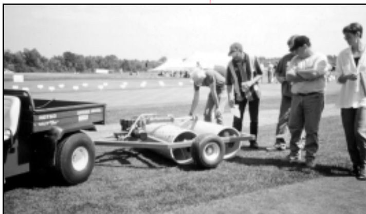
As this collage of photos shows, activities and speakers abound at the exciting 1999 Field Day.