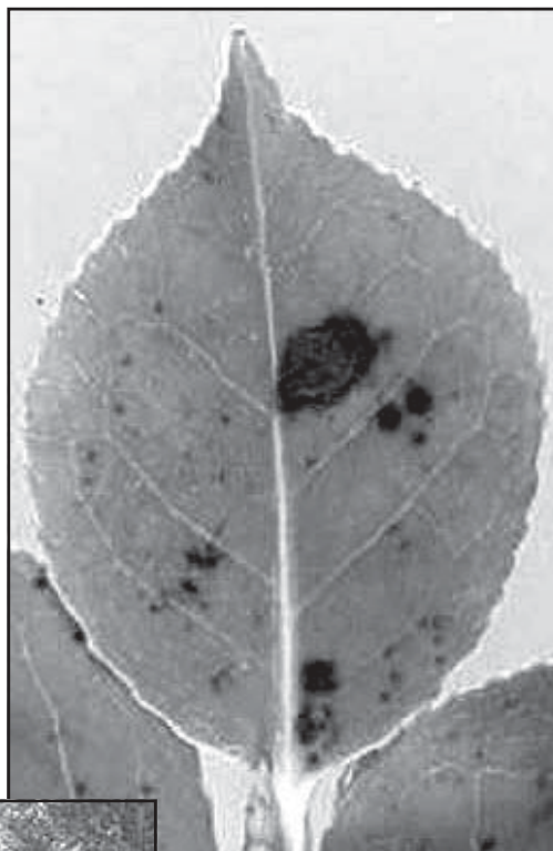
Above: P. ramorum damage on Camellia. Left: Ooze bleeds from a canker on an infected oak.