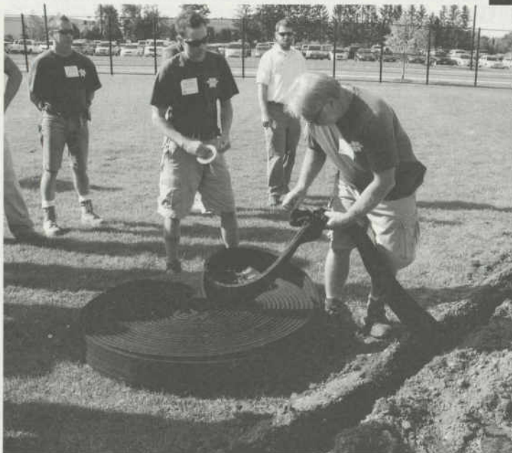
↕↕ Niskayuna High School grounds crew assists with drainage project demonstration.