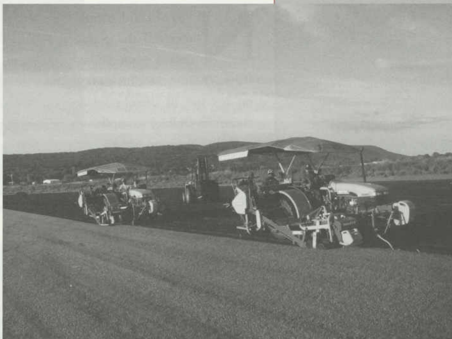
Early morning harvesting at DeBuck's Sod Farms of NY, Inc. The expanded field days includes tours of DeBuck Sod Farms.