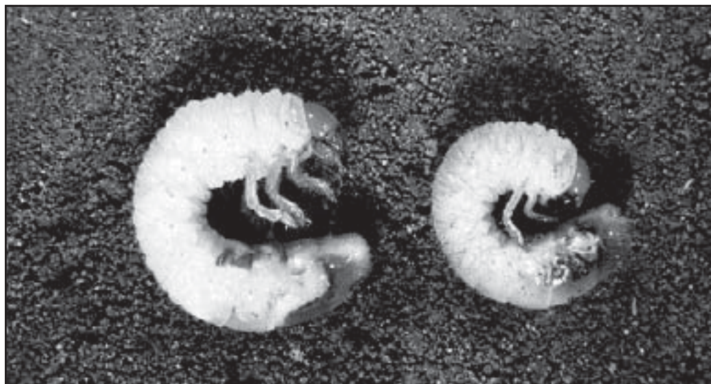
Grub size strongly influences control programs.

Entomopathogenic nematodes are an emerging biological organism for the control of soil inhabiting insects such as grubs. These wormlike organisms are able to infect the grubs and parasitize them, thereby causing their death. However, nematode performance, like most control systems that rely on a biological organism, is plagued by inconsistencies. Ques-