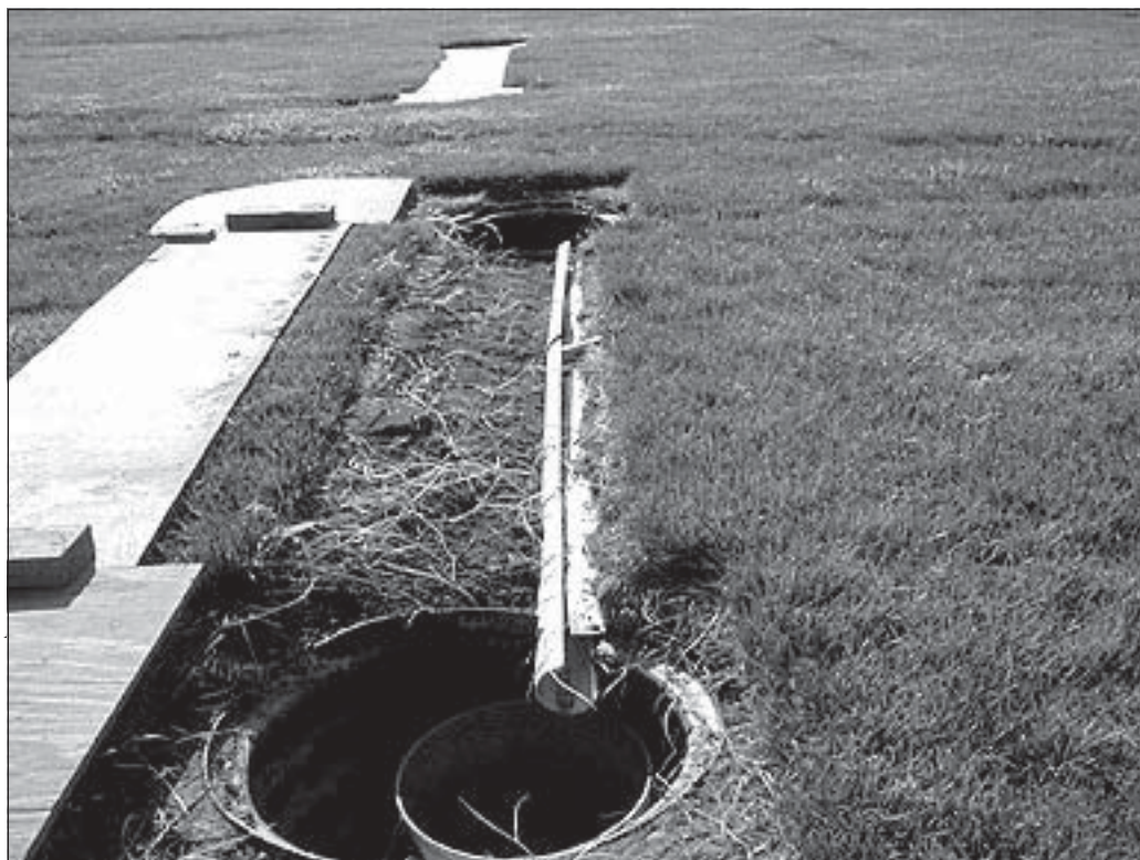
Runoff collection study area at the Cornell Turf and Landscape Research Laboratory.

depth and soil hydraulic properties. The assumption being that greater depth to the water table allows for greater residence time and increased degradation. This assumption may be valid for uniform, disturbed soils, with no macropore transport (preferential) flow. Soils under no-till management (such as turfgrass) have been found to have a very large macropore flow component.